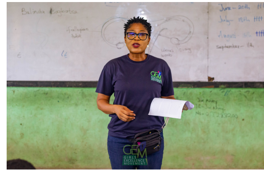
Group session on Menstrual Hygiene