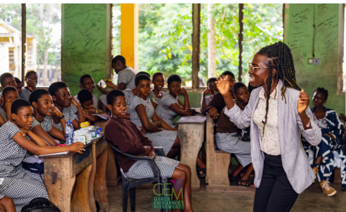
Group session on Confidence Building