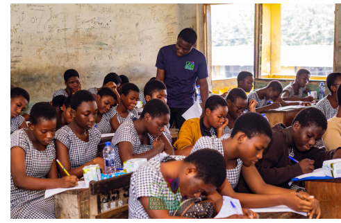
Group session on Online Safety