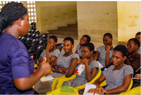
Group session on Peer Pressure