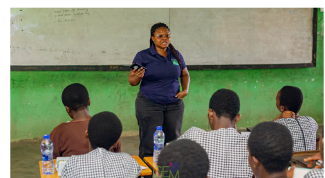
Group session on Personal Branding