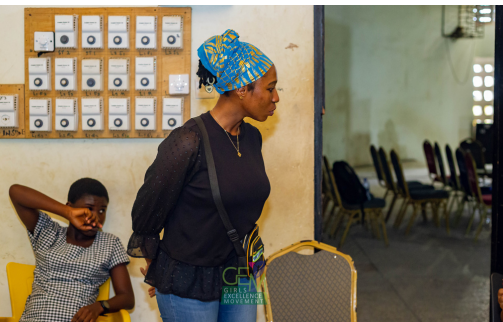
Group session on Savings