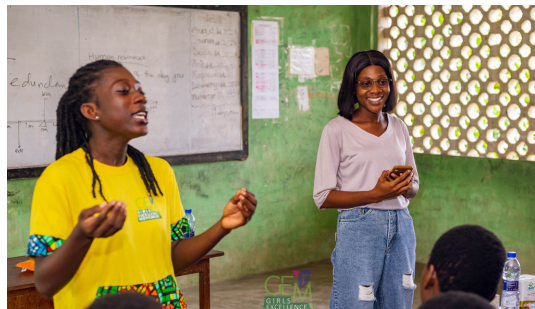
Group session on Effective Communication