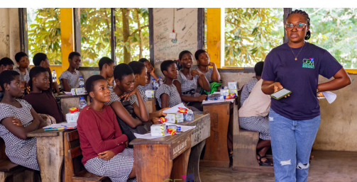
Group session on STEM