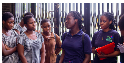
Group session on STEM