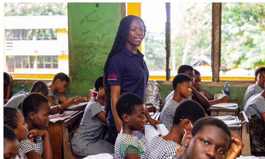
Group session on Entrepreneurship