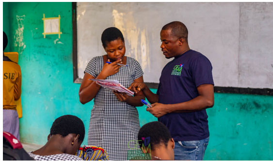
Group session on Career Choices