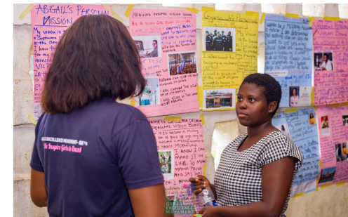
Group session on Vision Board